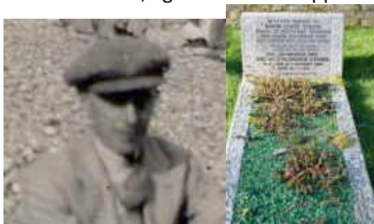
From Harper/Ames... /Upton/ tree on Ancestry